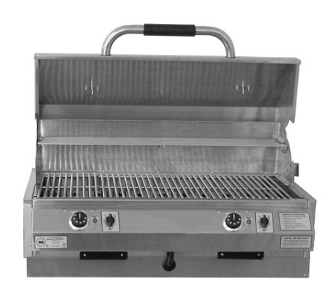
32" MODEL IS 4400-EC-448-IM-D-32 (DUAL CONTROL)

Required Outlet: NEMA 6-30R Receptacle 208/220 Volt 30 Amp receptacle 50/60 Hz