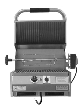
16" MODEL IS 4400-EC-224-IM-16