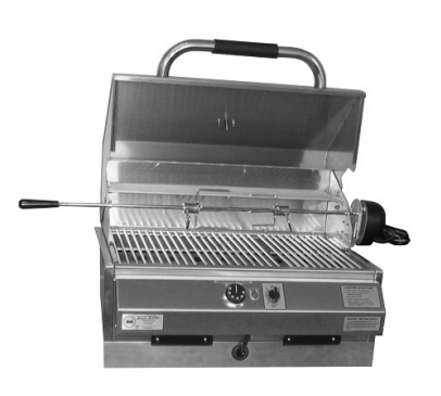
24" MODEL IS 4400-EC-336-IM-24

Required Outlet: Nema 6-20R Receptacle 208/220 Volt 20 Amp receptacle 50/60 Hz