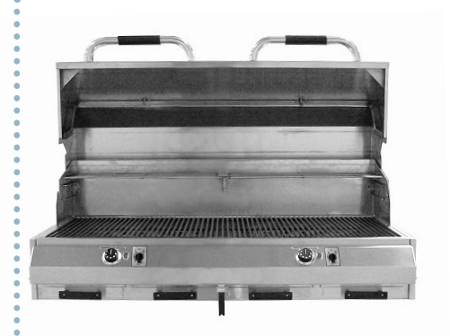
48" MODEL IS 8800-EC-1056-IM-D-48

Required Outlet: Nema 6-20R Receptacle 208/220 Volt 20 Amp receptacle 50/60 Hz