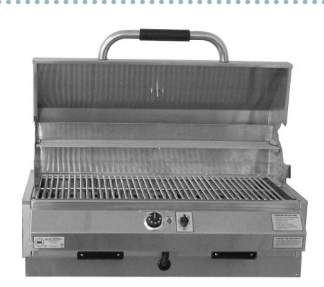
32" MODEL IS 4400-EC-448-IM-S-32 (SINGLE CONTROL)

Required Outlet: NEMA 6-50R Receptacle 208/220 Volt 50 Amp receptacle 50/60 Hz (use with 40 Amp breaker)